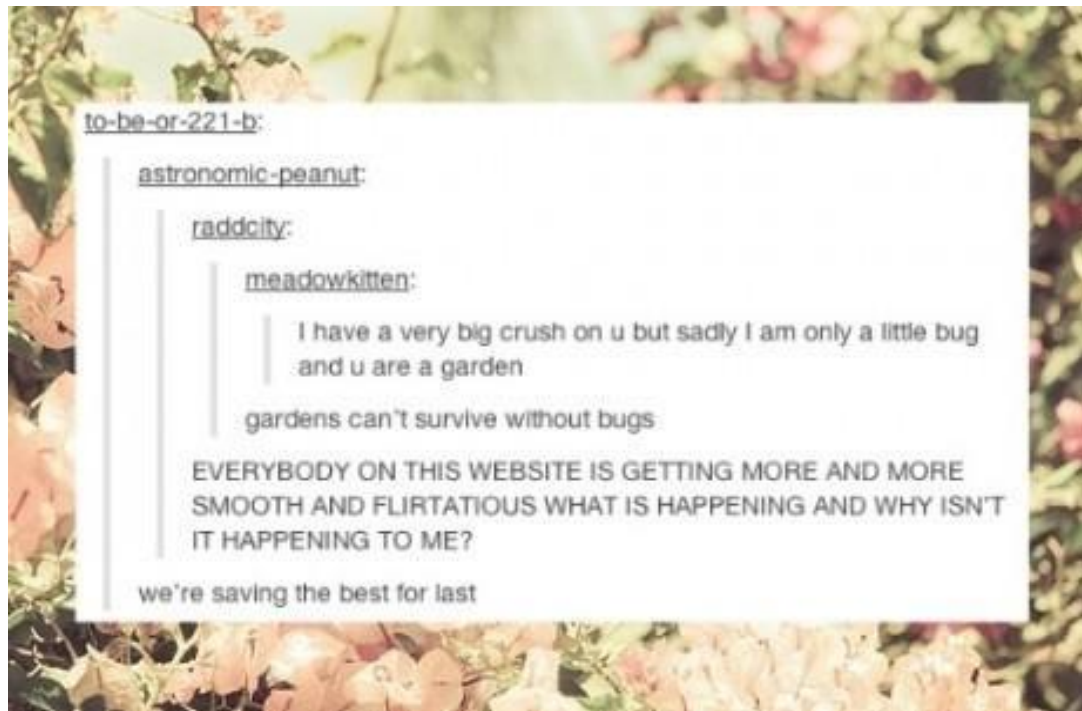
Figure 3: A screenshot taken from http://www.pleated-jeans.com/2014/01/07/18-times-tumblr-users-were-smoother-than-silk/

While text messaging has encouraged abbreviations and shortening of words, Tumblr has steadily been credited for the source of new words or phrases that are being used all over the internet and for some, in daily use. These Tumblr slangs are widely popular among teenagers regardless of their location or nationality and this forms a bonding tool of communication among people. More than often, these slangs of Tumblr revolve around the reactions of users to contents posted by other users. These words or phrases hardly mean what they do when taken in a literal sense but the frequent users of Tumblr identify heavily with them. The expressions have evolved from exclusively being used in text-like form of microblogging to inclusively being adapted into daily speech. Below are examples of words or expressions that are created or popularized by the platform (Douglas, 2012; Bargh & McKenna, 2004). The examples below show how expressions that can be used in daily life have derived from Tumblr, which shows how it has evolved into a tool for social interaction.